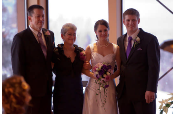
Flashback 32 years ago!